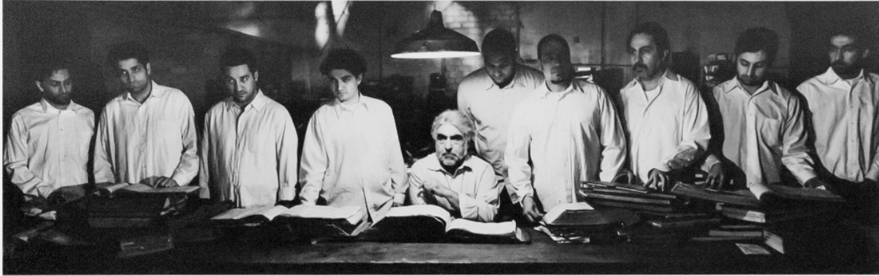
SHIRIN NESHAT, FROM THE LAST WORLD SERIES (2003), GELATIN SILVER PRINT, 4 X 12.8 INCHES