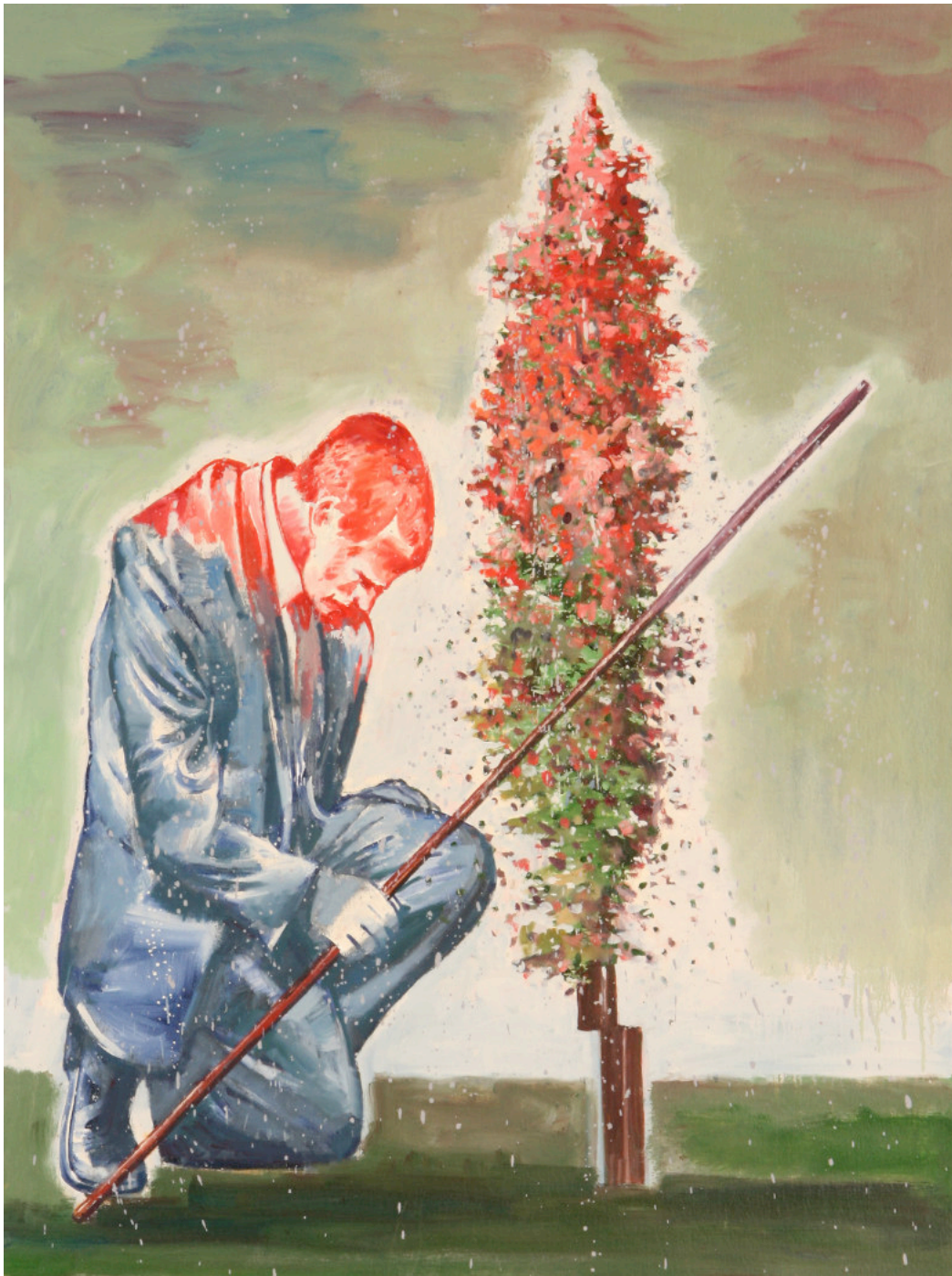
NICKY NODJOU MI, HOW TIMES CHANGE (2015), OIL ON CANVAS, 40 X 30 INCHES