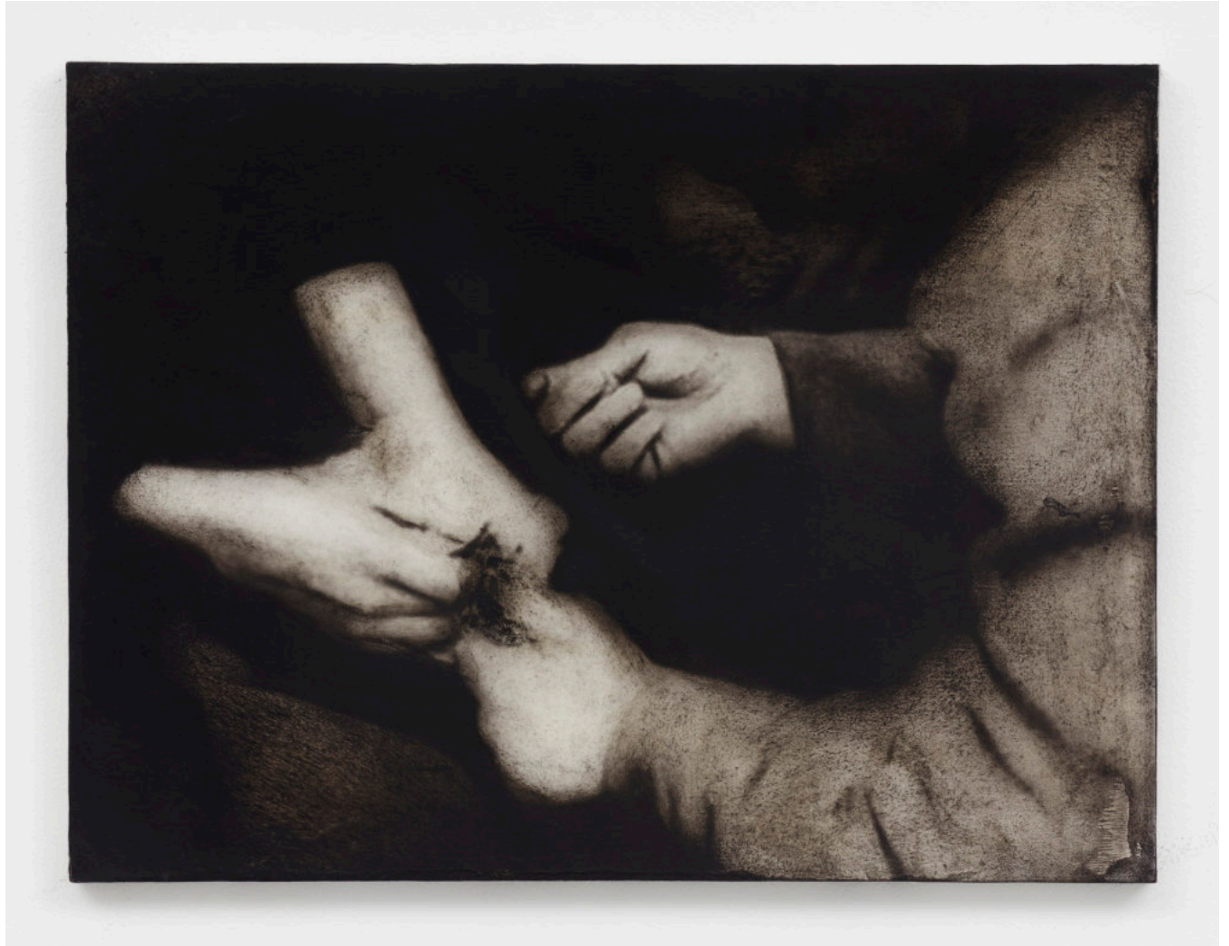
RAHA RAISSNIA, CADGE SERIES 04 (2014), OIL ON WOOD PANEL, 12 X 16 INCHES