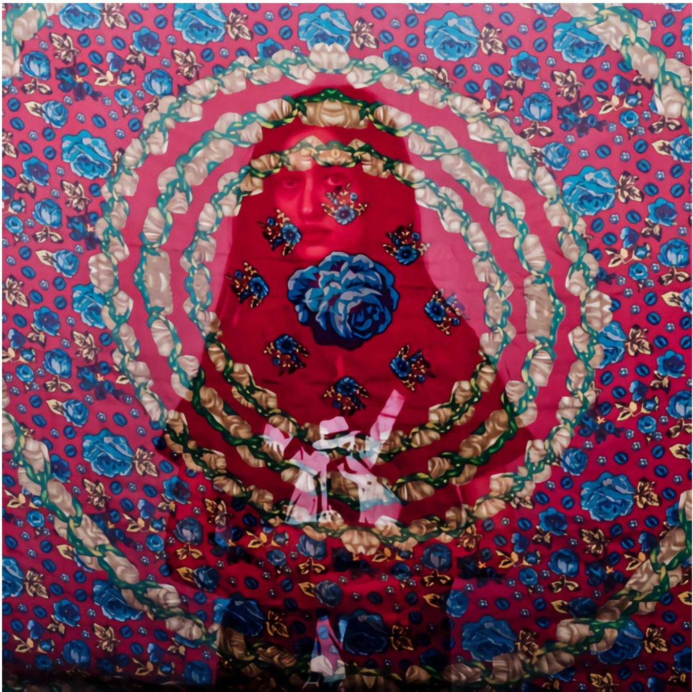
HOSSEIN FATEMI, NEGAR FROM THE SERIES "VEILED TRUTHS" (2013), ARCHIVAL INKJET PRINT, 35 X 35 INCHES