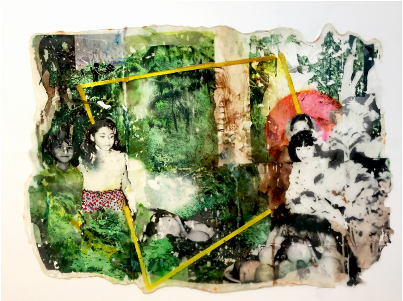
NAZANIN NOROOZI, THE BOOK OF JOY NO. 07 (2016), TONER TRANSFER, ACRYLIC AND RESIN, 27 X 20 INCHES