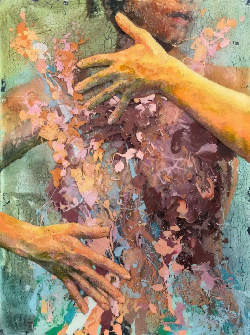
AFSHIN NAGHOUNI, THE GREAT CONFLICT (2016), OIL, ACRYLIC AND RESIN ON CANVAS, 43 X 36 INCHES