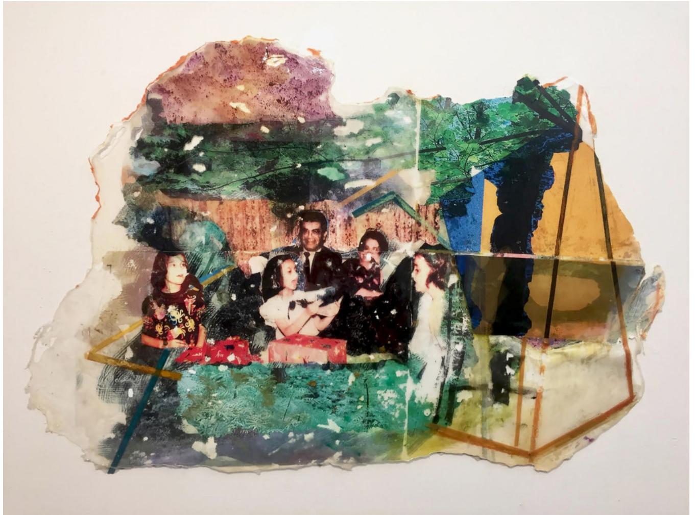
NAZANIN NOROOZI, THE BOOK OF JOY NO. 10 (2016), MIXED MEDIA AND RESIN, 31 X 22 INCHES