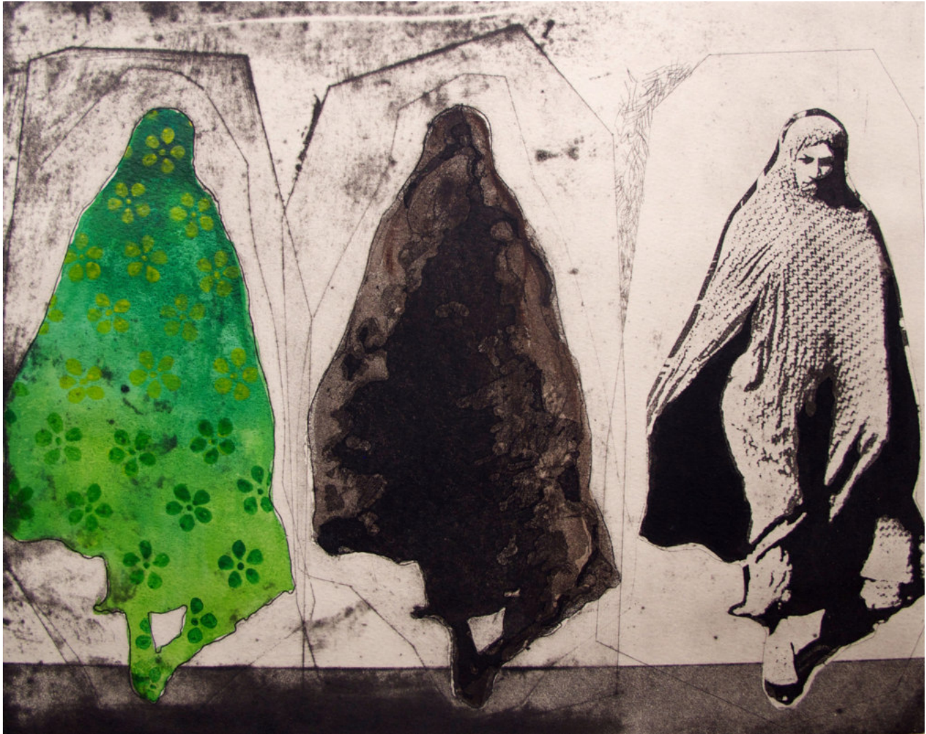
NAHID HAGIGAT, THREE WOMEN IN GREEN PATTERN (2015), HAND PAINTED ETCHING FROM 1970'S PLATE, 22 X 18 INCHES