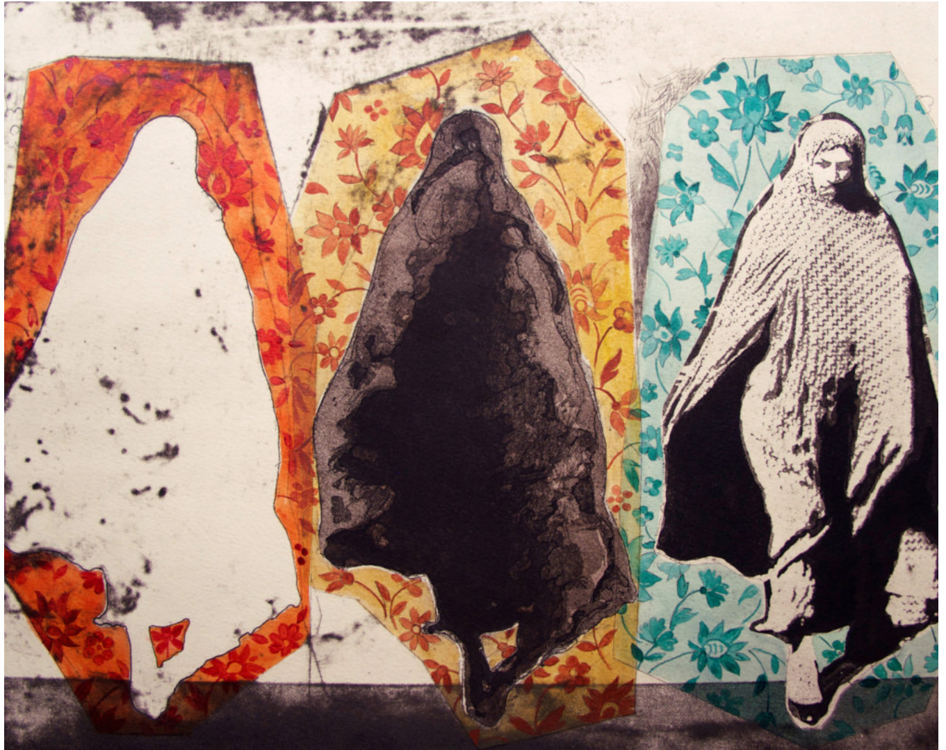
NAHID HAGIGAT, THREE WOMEN IN FLORAL PATTERN (2015), HAND PAINTED ETCHING FROM 1970'S PLATE, 22 X 18 INCHES