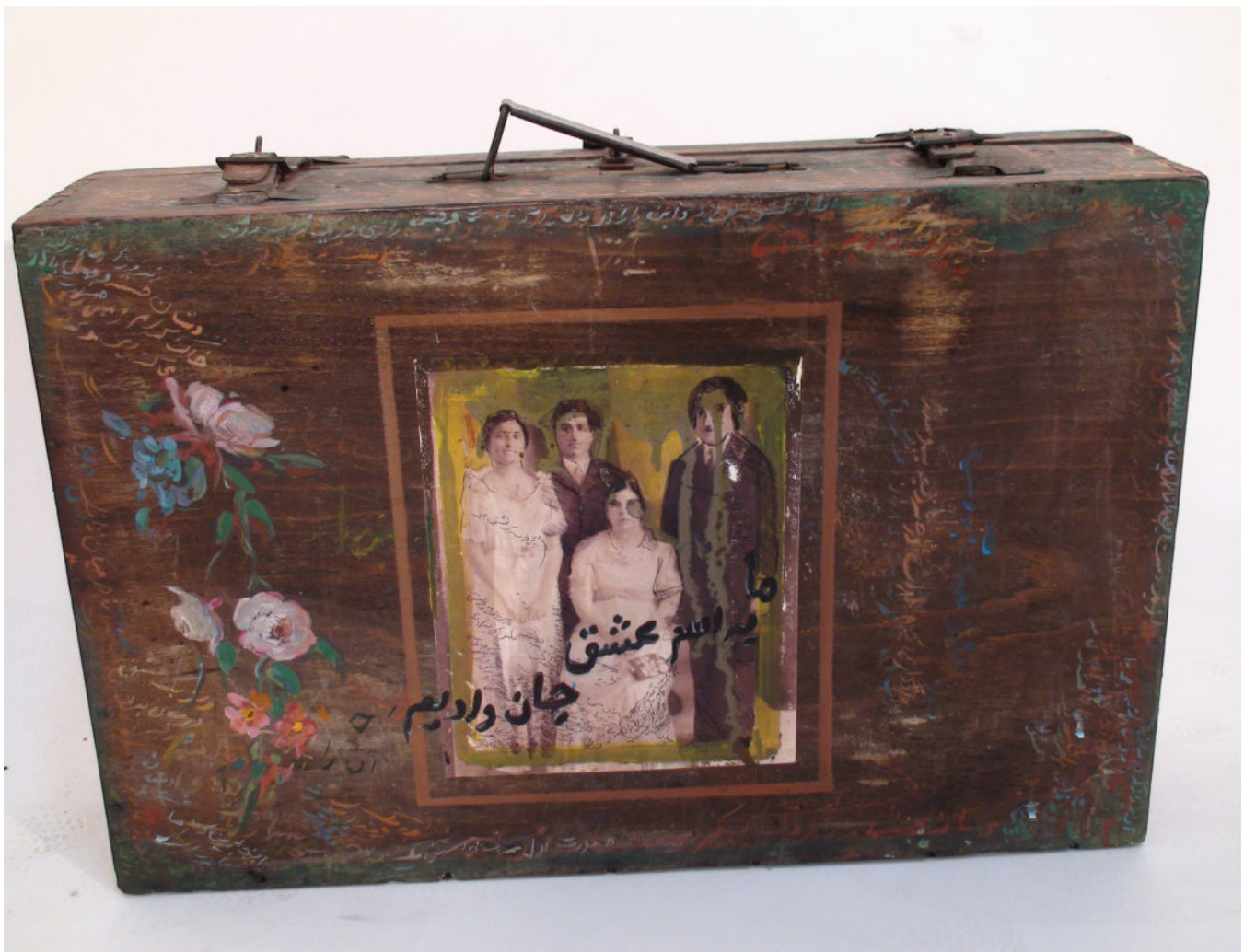
SHAHRAM KARIMI, SUITCASE (2007), MIXED MEDIA, 15.75 X 23.6 INCHES