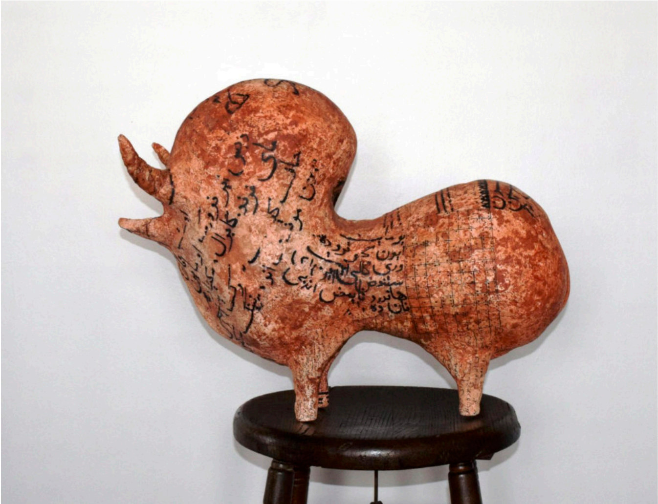
JASON NOUSHIN, THE GATE OF A HUNDRED SORROWS (2015), ENCAUSTIC, CONTE, PLASTER AND INK ON WIRE, 16.5 INCHES