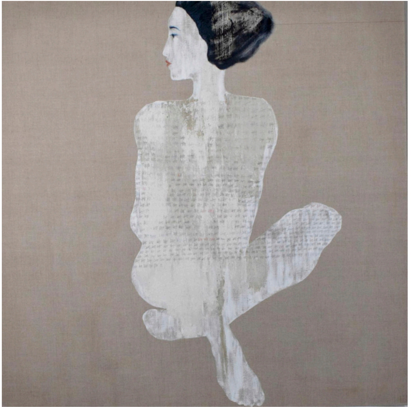
JASON NOUSHIN, FENUGREEK (2016), OIL, CEMENT, PLASTER, COLORED PENCIL AND BRASS WIRE ON LINEN, 46 X 46 INCHES