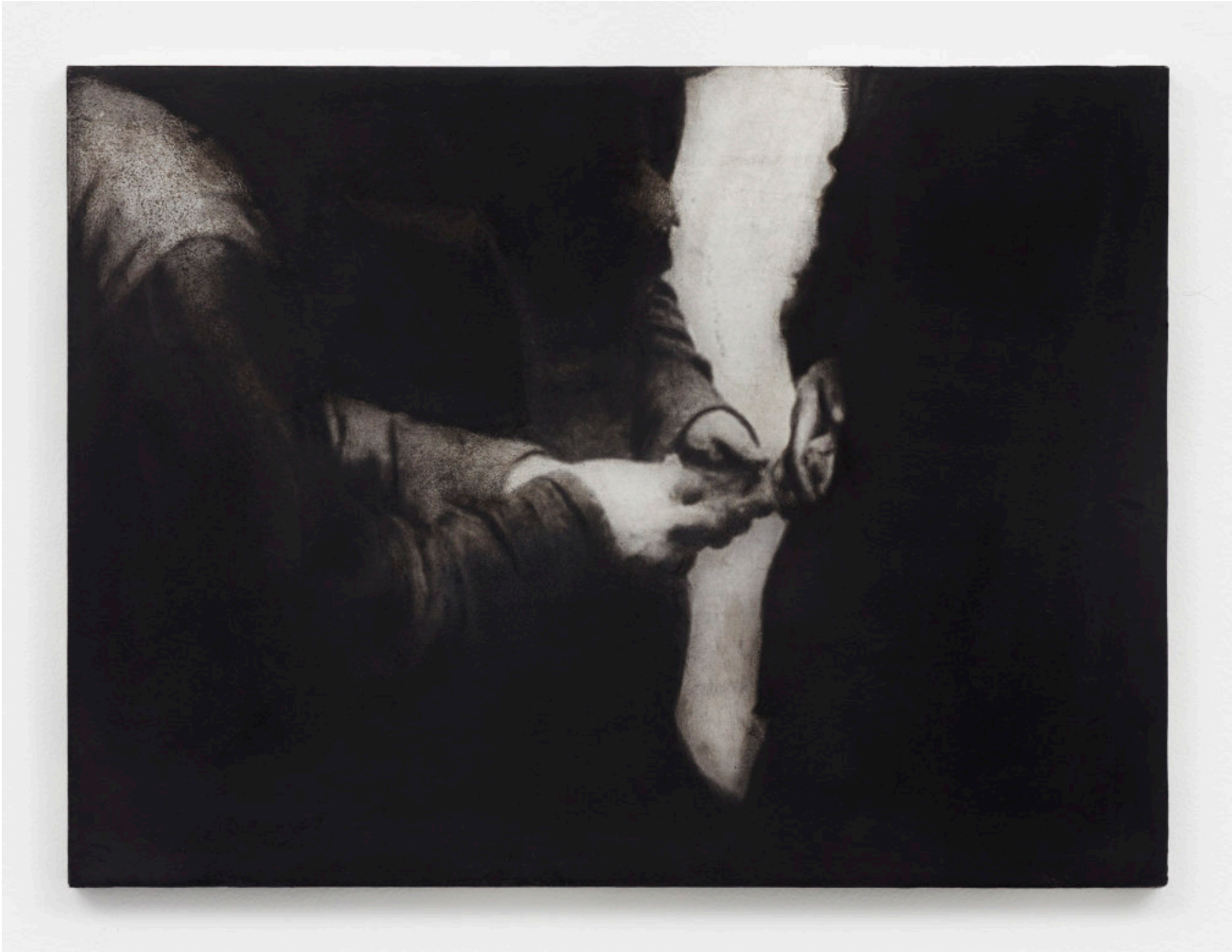
RAHA RAISSNIA, CADGE SERIES 01 (2014), OIL ON WOOD PANEL, 12 X 16 INCHES