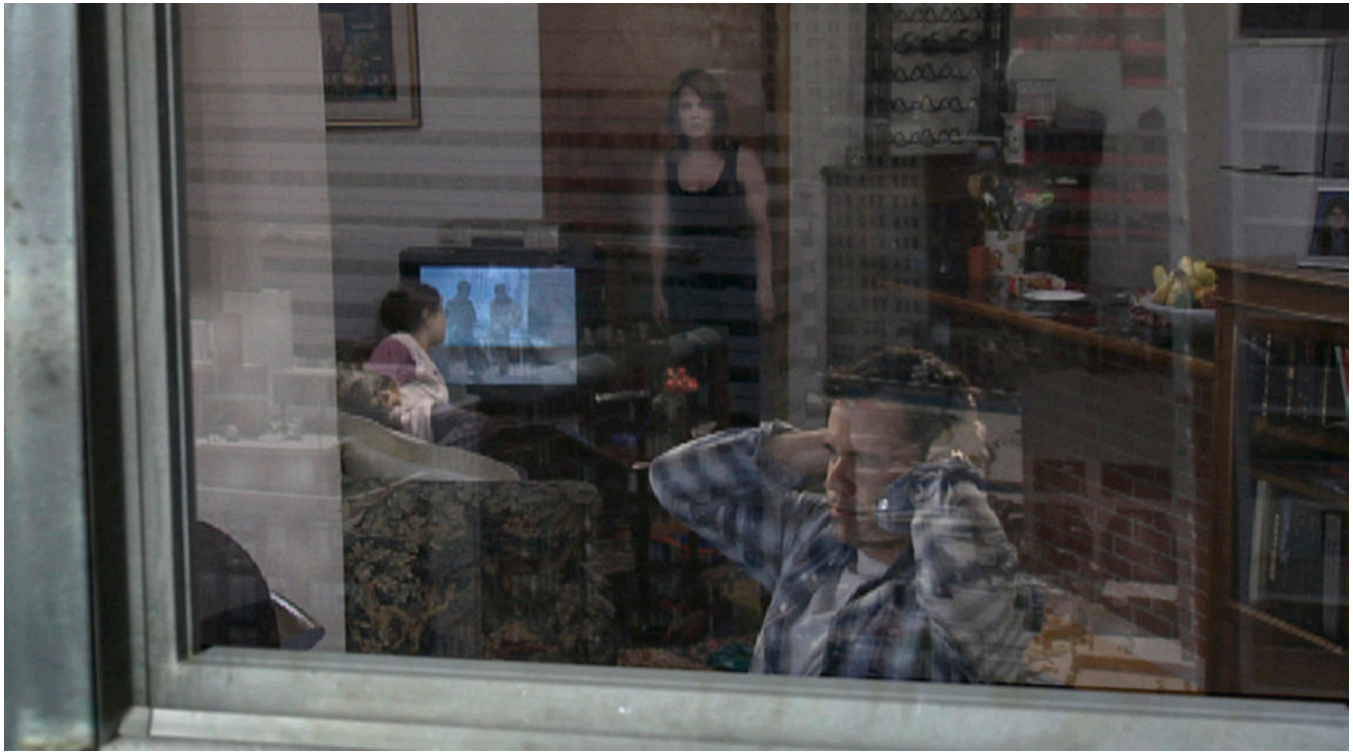
SHOJA AZARI, "A FAMILY" (FROM WINDOWS SERIES) (2006), CIBACHROME COLOR, 24 X 26 INCHES