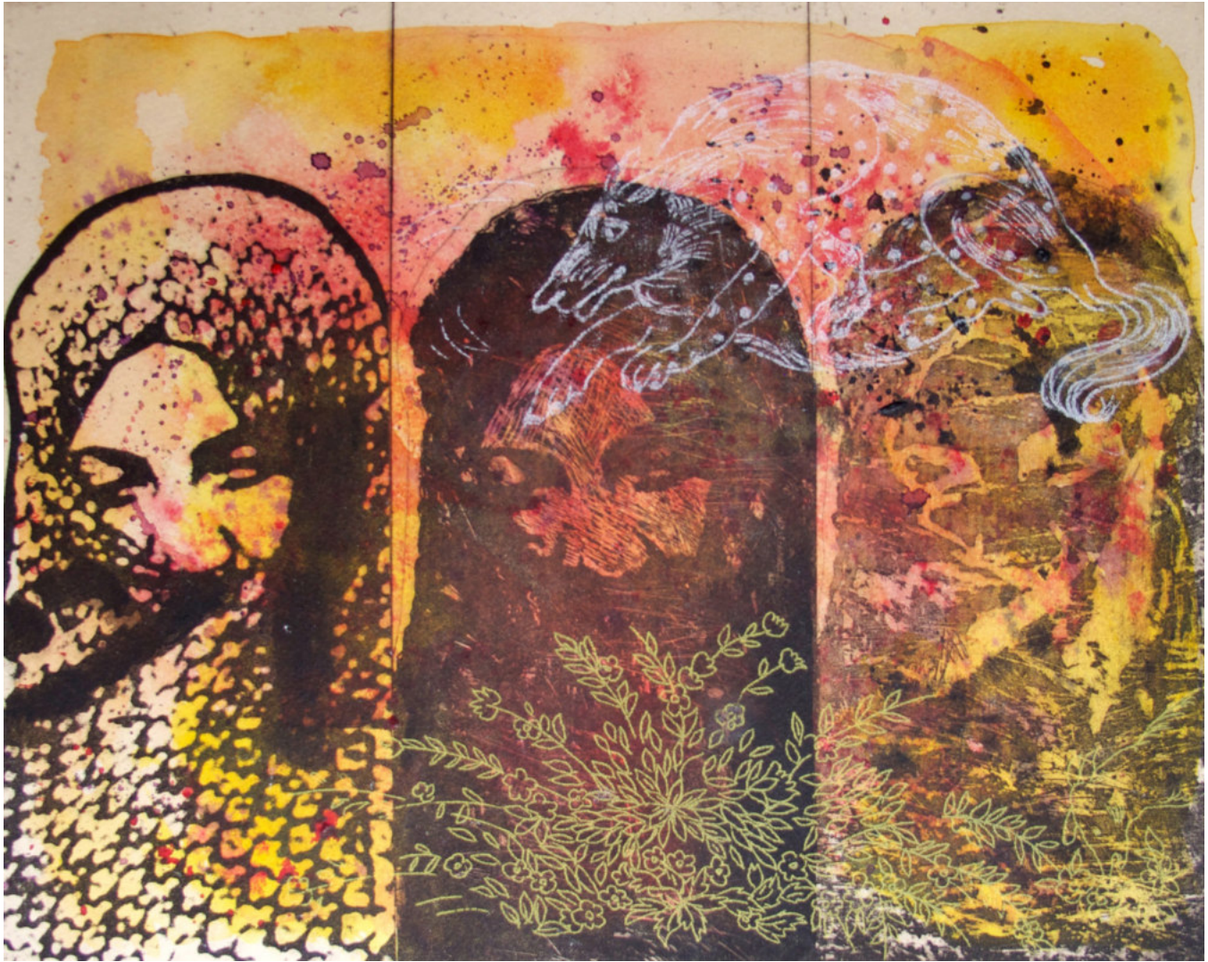
NAHID HAGIGAT, THREE FACES WITH WHITE ANIMAL (2015), HAND PAINTED ETCHING FROM 1970'S PLATE, 22 X 18 INCHES