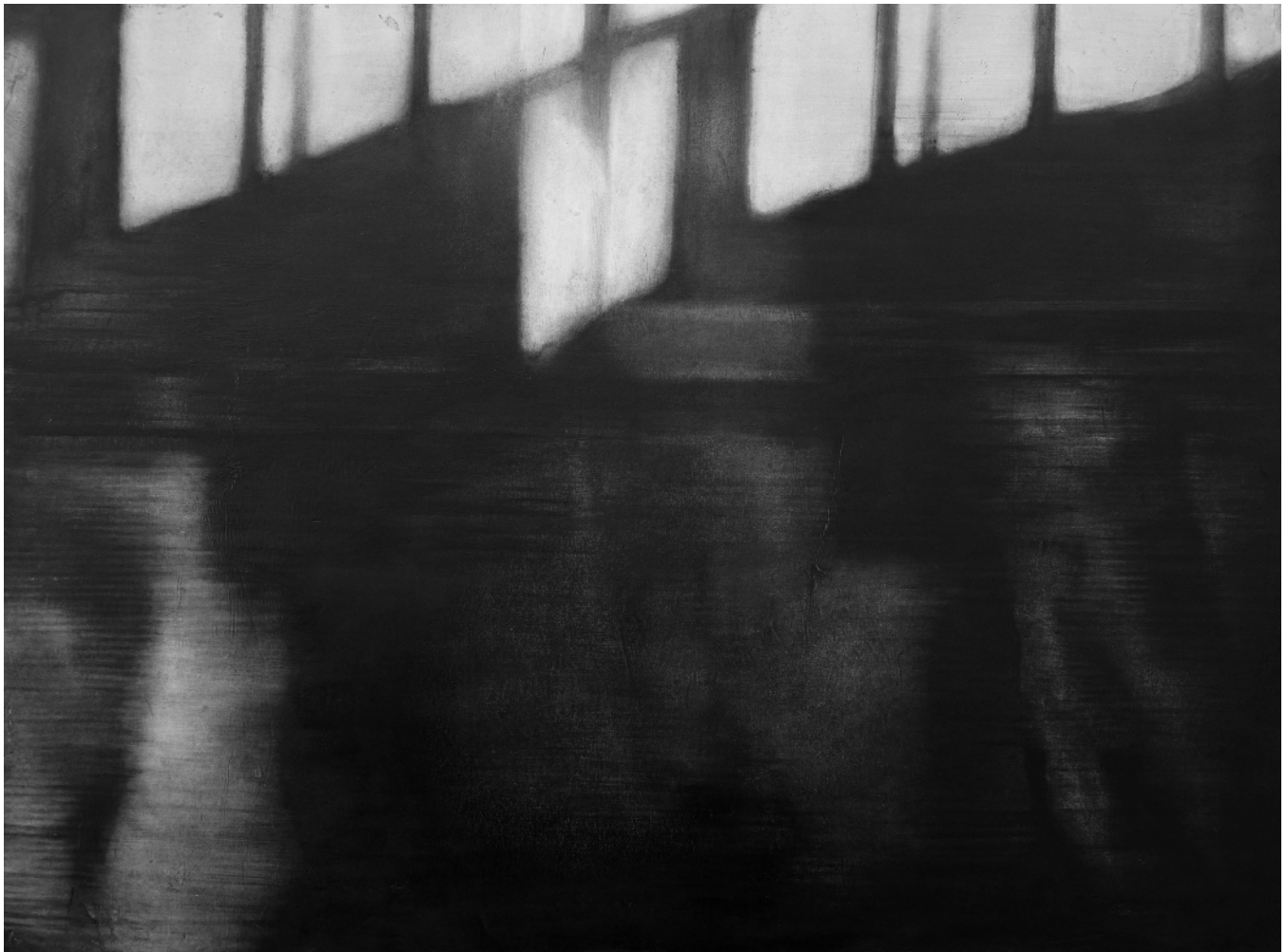
RAHA RAISSNIA, UNTITLED (2015), OIL ON WOOD PANEL, 24 X 34 INCHES