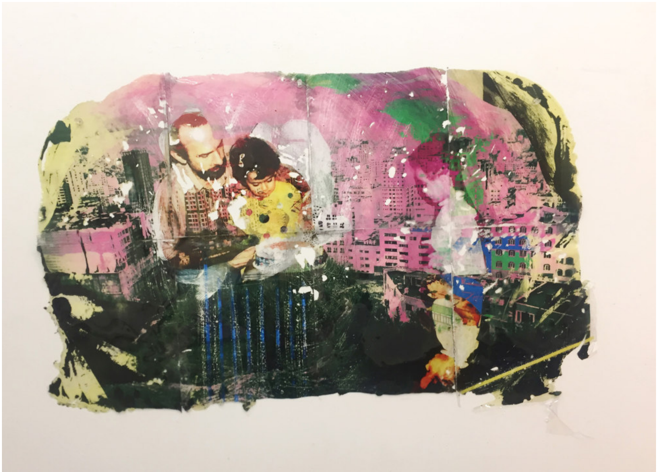
NAZANIN NOROOZI, THE BOOK OF JOY NO. 12 (2016), MIXED MEDIA AND RESIN, 32 X 19 INCHES