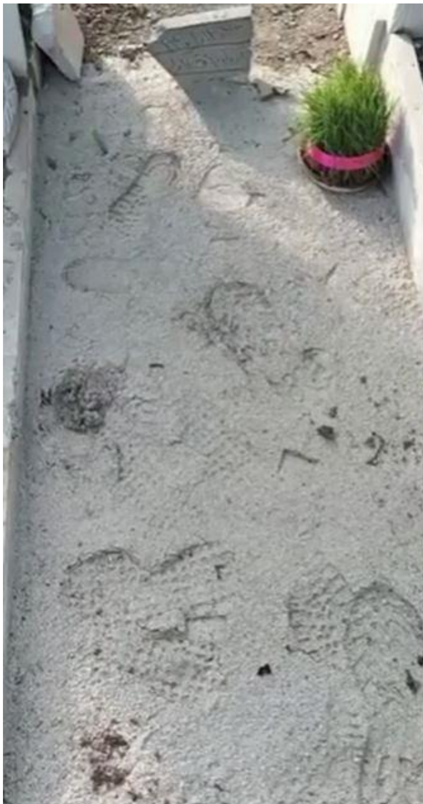
Arian Khoshgavar's grave. The picture shows his grave after it was vandalised with the cement containing multiple shoe prints