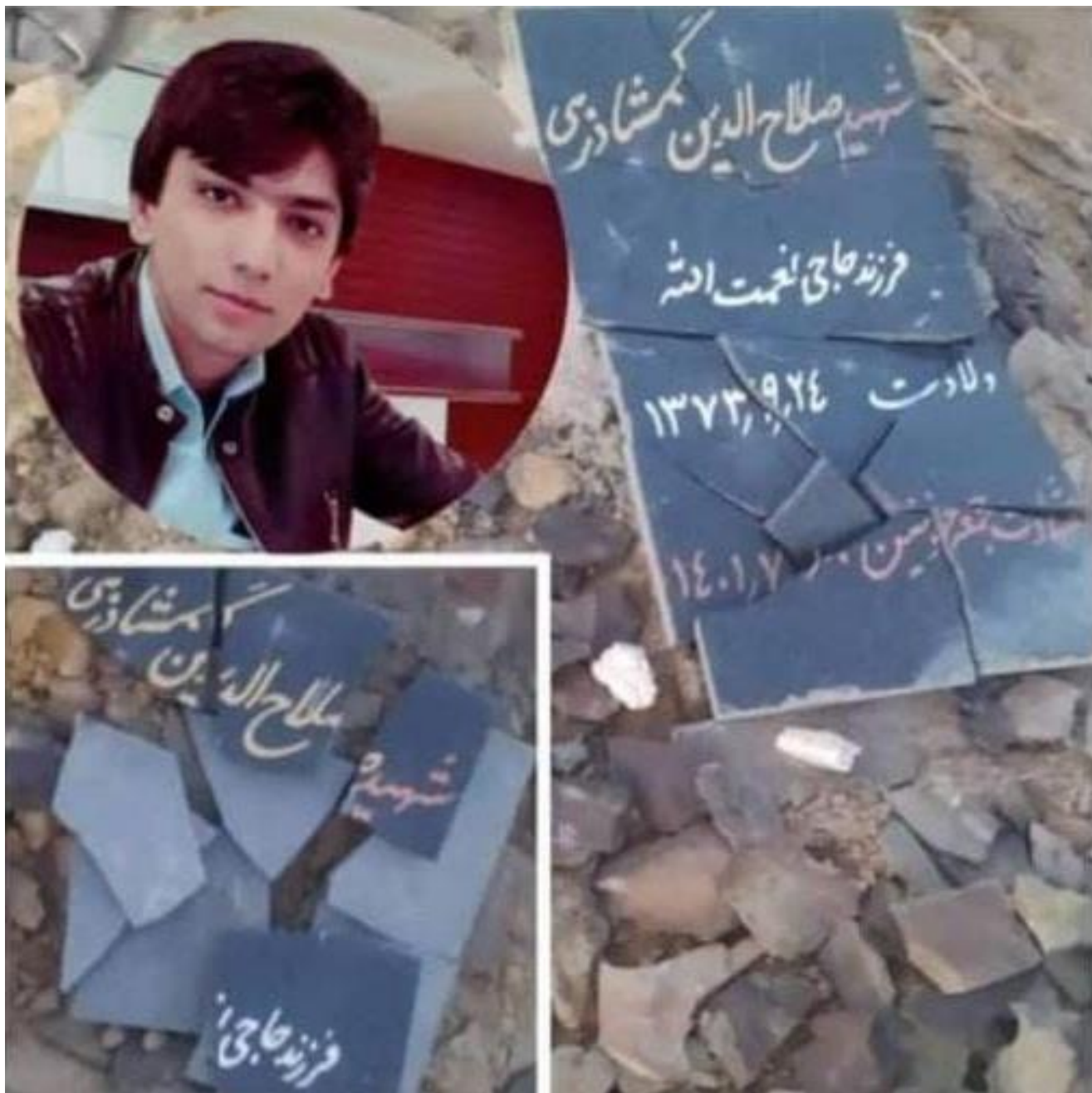
Salaheddin Gamshadzehi's grave. The picture shows his gravestone smashed into pieces.