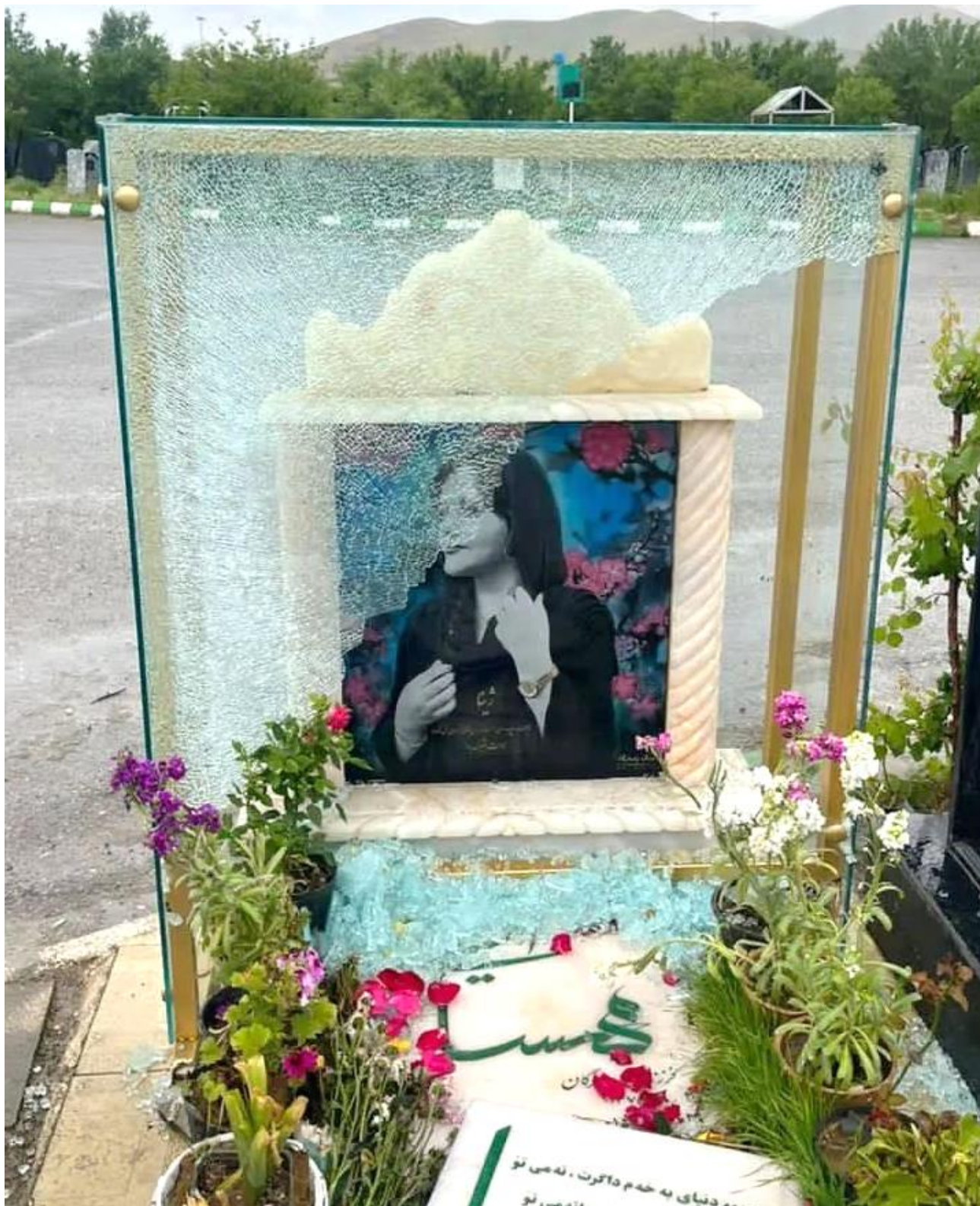
A picture of the vandalised grave of Mahsa/Zhina Amini, taken on 21 May 2023, with the glass encasing the headstone broken.