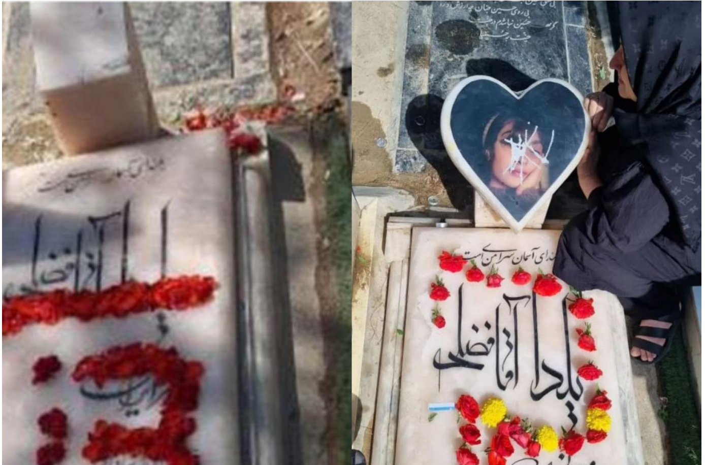
Yalda Aghafazli's gravesite. The picture on the left is from April 2023, when the heart-shaped part of her headstone containing a picture of her face was removed. The picture shows the pillar that remained afterwards. The family reinstalled a heart-shaped headstone several days later. The picture on the right is from August 2023 when lines were scratched onto her face on her headstone.