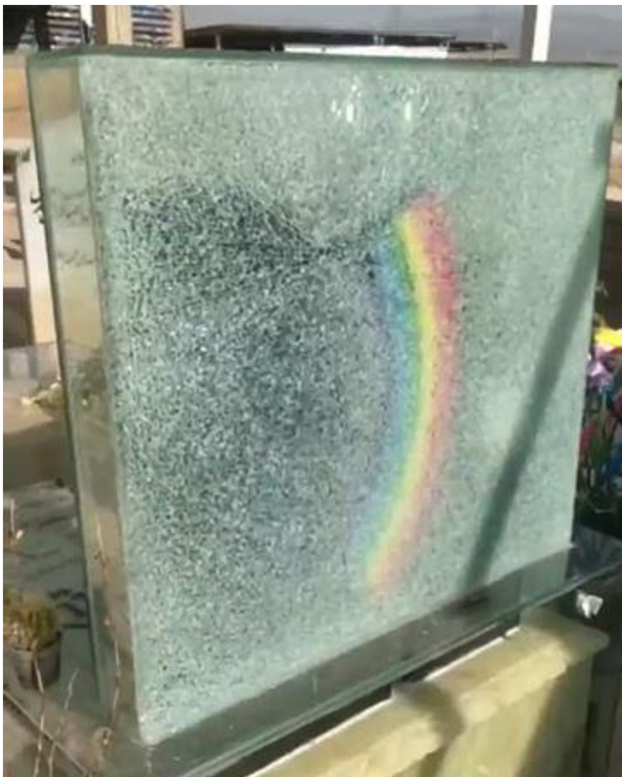
Kian Pirfalak's vandalised grave. The picture is a still from a video taken of his grave which showed that the glass encasing his headstone had been smashed.