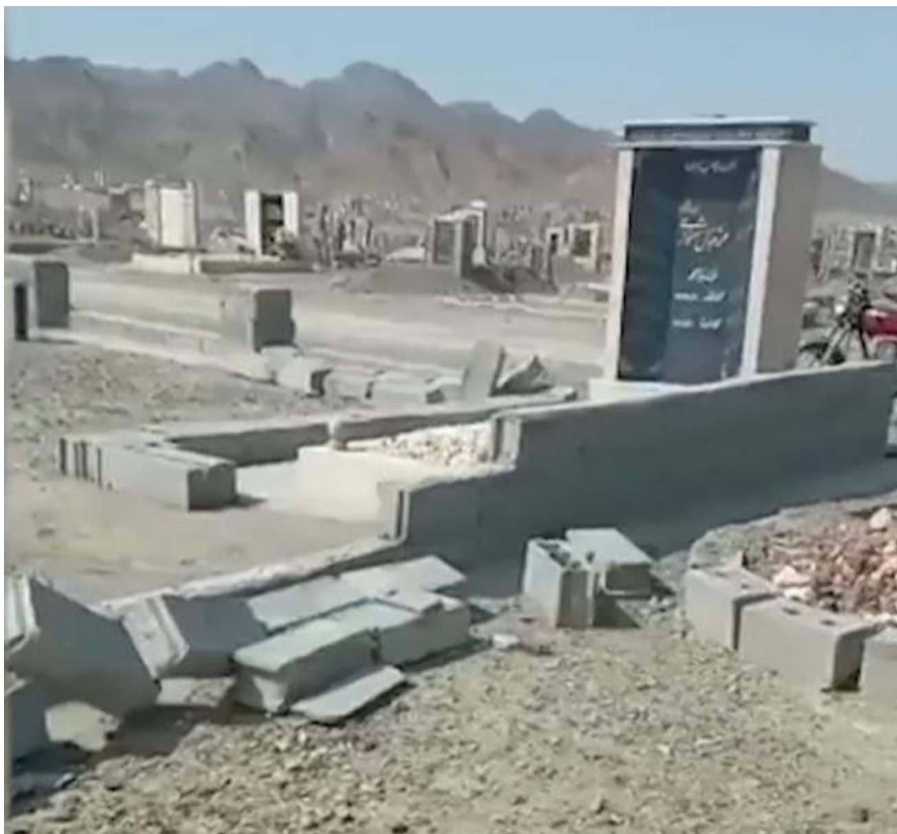
The grave of Mohammad Eghbal Shahnavaazi (Nayebzehi). The picture shows his gravesite after it was vandalised, with some of the bricks forming the raised concrete structure around his grave broken.