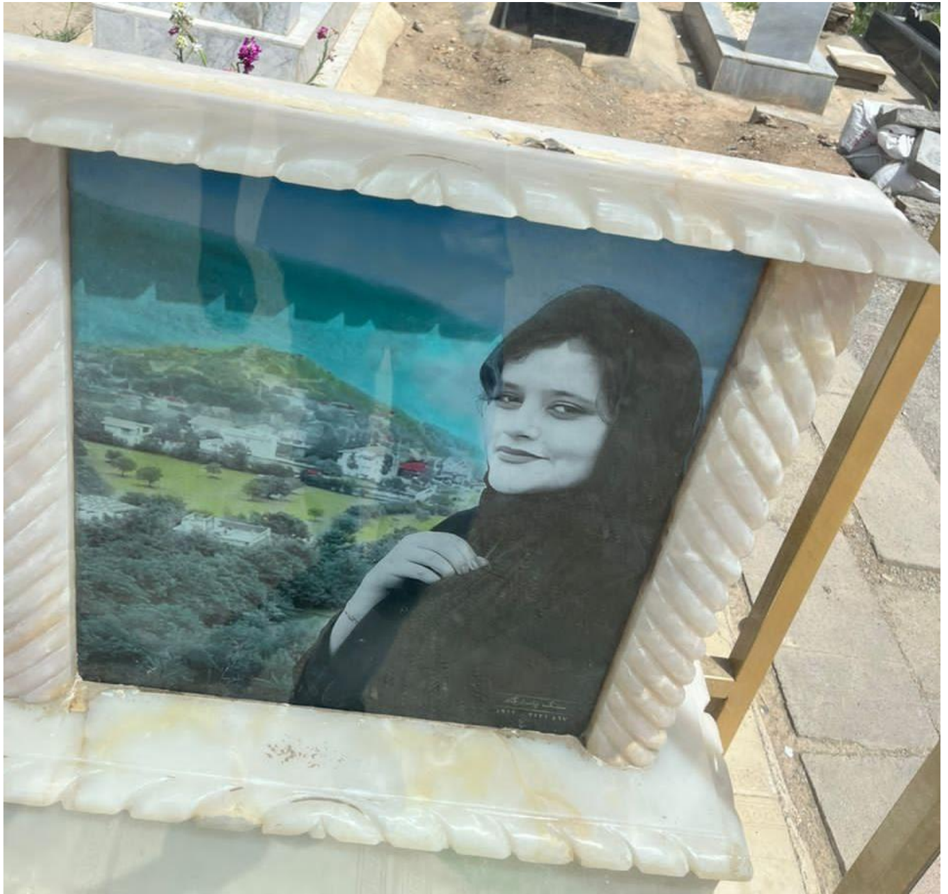
A picture of Mahsa/Zhina Amini's grave after it was vandalised for the second time, on 23 May 2023, this time with the crown on the headstone broken off and removed.